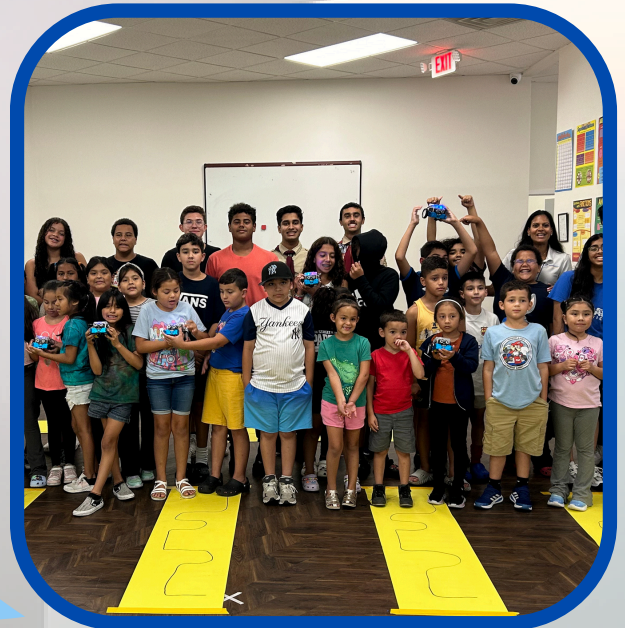
Ironbound Community Center (COMMUNITY PARTNER)

I want to thank the Arman Roy Foundation for putting together an amazing robotics workshop for our students. They had such a great time learning about all the different components of STEM and are still buzzing about how much they learned. I believe it is so important for them to have diverse experiences to spark their minds early and show them they can achieve anything they set their minds to.